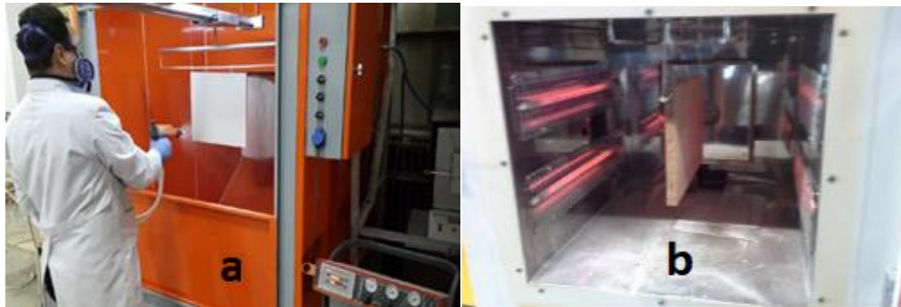
Fig. 2. a) The application of powder coating on particleboard by using electrostatic manual spray gun. b) The curing system with infrared lamps applied to powder coating on particleboard

The electrostatic powder paint was applied on the surfaces by utilizing this electrical field (Okutan and Ozcan 2014). After the panels were cured at low temperatures inside the chamber, the epoxy, polyester, and epoxy-polyester (hybrid)-based powder paints were applied at 120 \text{ g/m}^2 to the MDF and at 150 \text{ g/m}^2 to the particleboard and plywood surfaces using a corona electrostatic spray gun (Elektron Powder Coating Equipment, Istanbul, Turkey) (Fig. 2).