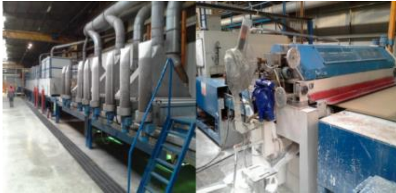
Fig. 3. Roller coater system used to coat panels