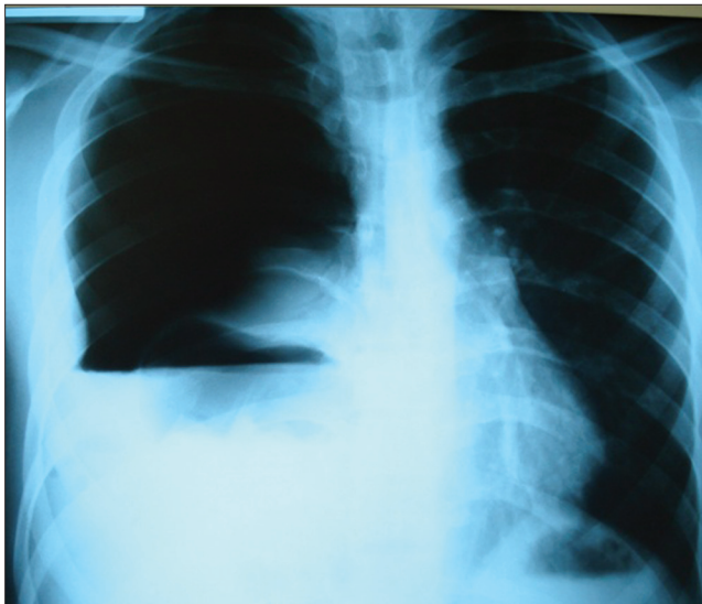
Figure 1. Hydropneumothorax developing after perforation of right hydatid cyst is observed on the postero-anterior chest X-ray.

All patients underwent double-lumen endotracheal intubation under general anesthesia. Entrance into the thorax in patients that had only lung cysts was made via a posterolateral thoracotomy incision in the fifth intercostal space with the patient in the lateral decubitus position. In patients with accompanying liver cysts, the entrance was