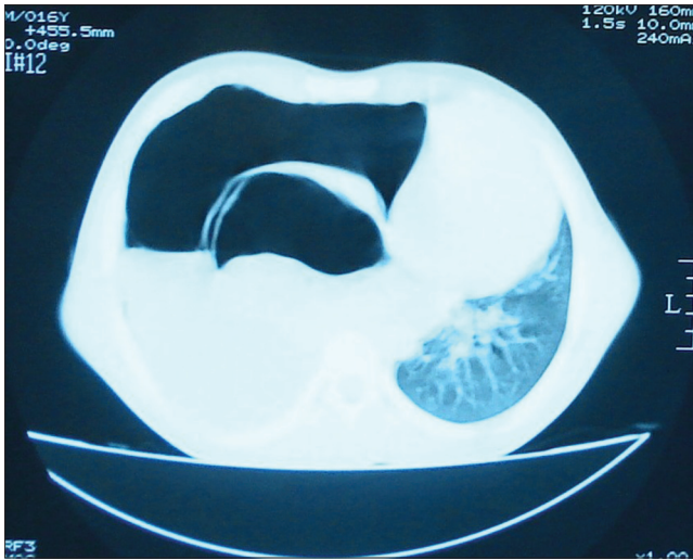
Figure 2. The view of perforated cyst causing right hydropneumothorax on thoracic tomography.