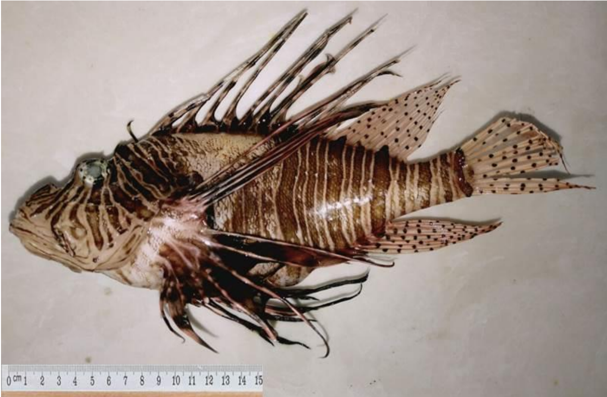
Figure 2. P. volitans was observed in Yeşilovacık Bay, Turkey