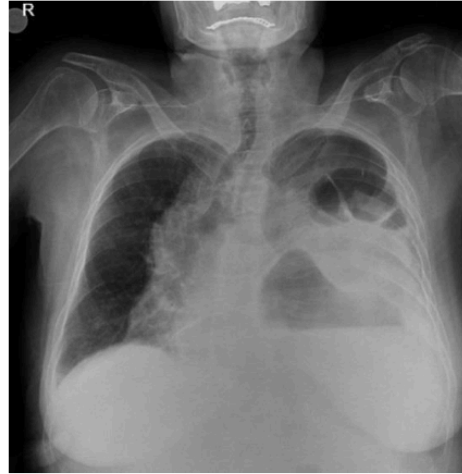
Figure 2. Intestinal air is seen in the left hemithorax.

In our patient's laboratory examination, a slight neutrophil increase ( 7.8 \cdot 10^3/uL ) and CRP increase (3.3 mg/dL) were observed in the hemogram. Apart from these, we look at the biochemical and hematological parameters were normal.