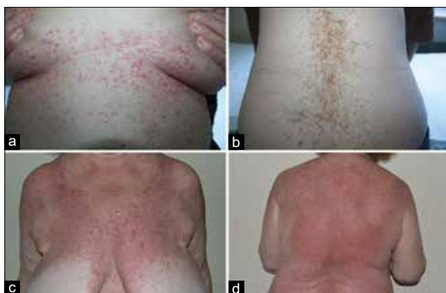
Figure 1: Erythematous, red-brown papulovesicular lesions under both breasts (a) and lumbar region (b). Generalized erythema and had aggravation of lesions on the chest (c) and back (d)

doses were applied 0.5 joule/cm 2 . The patient developed generalized erythema and had aggravation of lesions after five sessions of PUVA phototherapy; therefore, the treatment was discontinued [Figure 1c and d].