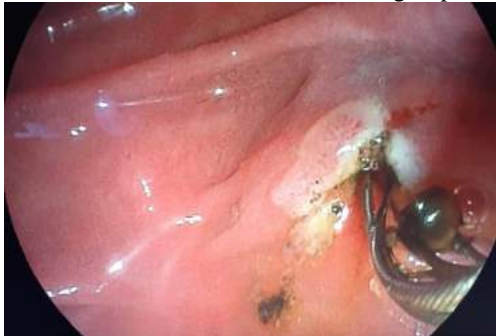
Figure 2. Choledochal stone was removed after endoscopic sphincterotomy

Difficult ERCP was due to the difficulty of selective cannulation of choledochus. Precut sphincterotomy was performed in these patients and the procedure was performed successfully in the second ERCP (Figure 2). The mean length of hospital stay in group A and group B patients was 5.29 \pm 3.38 and 6.29 \pm 5.39 , respectively, and the average cost was 474 \$ \pm 286 \$ and 564 \$ \pm 664 \$ , respectively, with no statistical difference between the groups.