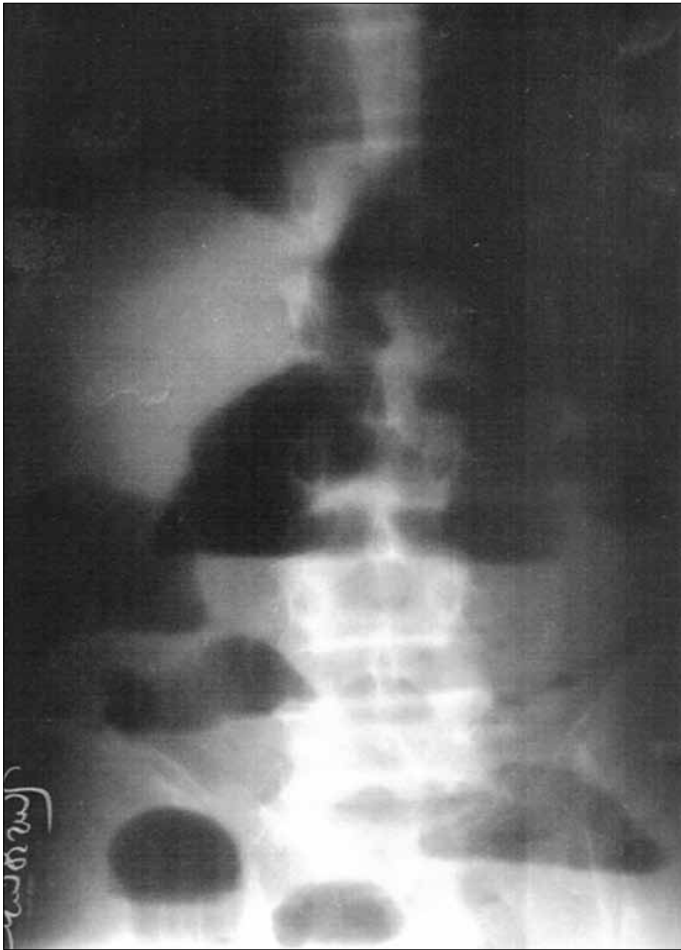
Figure 1. Multiple air fluid levels seen on plain abdominal graphy

with a wide lumen was found with a fistula into the distal ileum (5). Internal appendicular-intestinal fistula as a complication of acute appendicitis (6), appendico-enteric fistula (7, 8) and appendico-ileal fistula were also present as an ileal mass (1). An appendico-ileo-vesical fistula secondary to appendiceal diverticulitis demonstrates the importance of barium enema and colonoscopic examinations in the diagnosis and treatment of a complicated enterovesical fistula. Ileocecal resection and fistulectomy with primary reconstruction were performed (9).