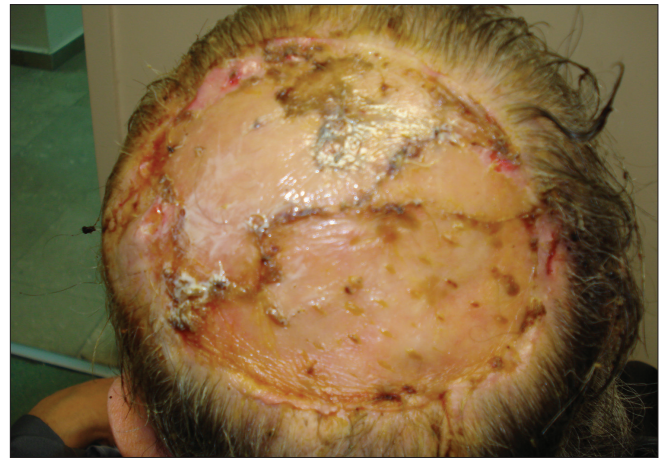
Figure 2: After treatment- with grafting