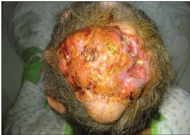
Figure 1: Before treatment - fluctuant masses lined with hair on the parietal region