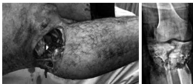
Figure 2. Preoperative photograph and X-ray of our second case: Left popliteal artery and vein injuries together with the bone fractures, and near-subtotal amputation are seen.

nerve repair, open reduction and internal fixation of right lateral malleolus of tibia and debridement were performed by the orthopedist and neurosurgeon. On control examination two hours later, we observed that the saphenous vein grafts have been thrombosed. Repeat thrombectomy was performed, and the patency of the grafts were achieved; 2 U of erythrocyte suspension and 1 U of fresh frozen plasma were replaced intraoperatively, and the patient was taken to cardiovascular surgery intensive care unit. During postoperative follow-up, four-compartment fasciotomy was performed liberally to prevent compartment syndrome below the open left knee through both medial and lateral longitudinal incisions. Heparin infusion (1000 U/hour) was administered, and the patient was followed by hourly measurements of activated clotting time (ACT). The patient had minimal bleeding, in the style of leakage from the bandage, however heparin infusion was continued, and ACT was kept over 200 seconds. Two units of erythrocyte suspension were replaced on the first postoperative day, and subcutaneous low-molecular-weight heparin (LMWH) (enoxaparin), 1000 IU/10 kg twice daily was given instead of heparin after the first 24 hours. Distal pulses were palpable in both lower extremities on the postoperative examination. Then, the patient was transferred to plastic surgery and orthopedics clinics. The soft tissue defect was reconstructed with free vascularized soft tissue flap transfer by plastic surgeons.