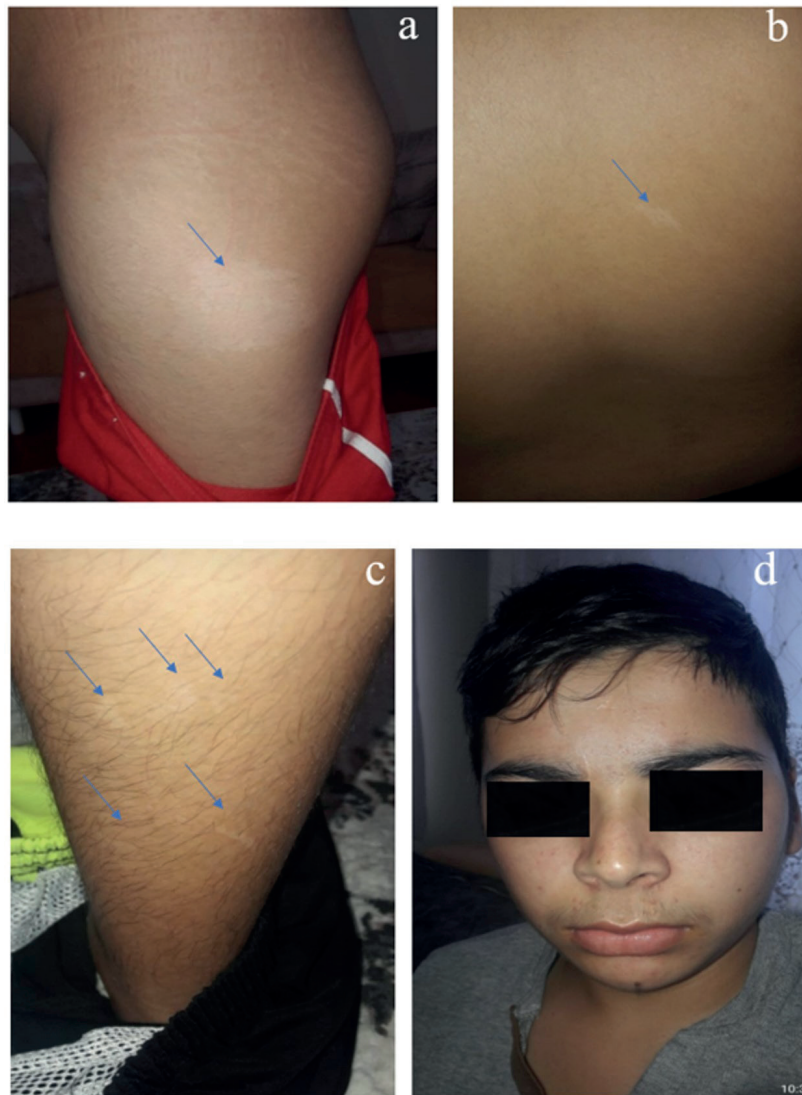
Figure 1. Hypopigmented macules, the largest being 5x4 cm and the smallest 0.5x1 cm in both lower extremities and right scapular region (a, b, c), angiofibromas in the facial area (d).