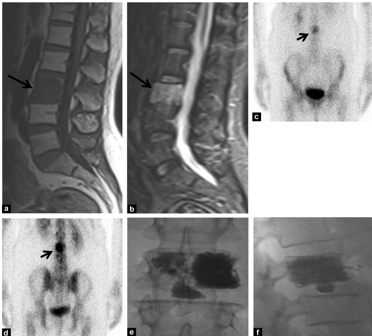
Figure 2. Hypointense metastatic involvement on sagittal T1-weighted image on L3 vertebral body (large arrow) (a) and hyperintense metastatic involvement on STIR sagittal image (large arrow) (b) in a 45-year-old woman with primary breast malignancy before PV. Increase in metabolic activity on L3 vertebral body is shown on bone scintigraphy scan (small arrow) (c, d). PMMA bone cement leakage into the L3-L4 disc and left paravertebral vein after PV (e, f).

significant decrease in VAS scores of patients with vertebral metastases of breast cancer [16]. In our department, median VAS scores of 79 metastatic vertebrae of 43 patients with primary malignancy was 8 before, 3 within one day after, 2 after 1 week and 2 three months after the procedure. In our study, the decreases in VAS scores after the procedure was consistent with the literature data. PV provides a quick relief of pain in patients with vertebral metastasis.