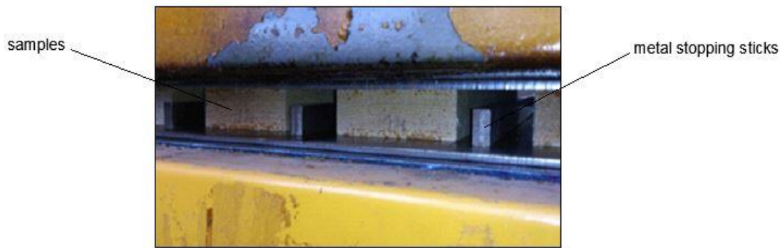
Fig. 1. Densification of the samples