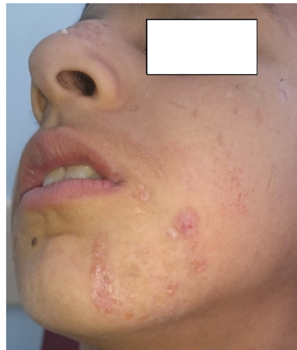
Figure 3. Yellowish-brown, slightly elevated papular lesions located in the left cheek after treatment.