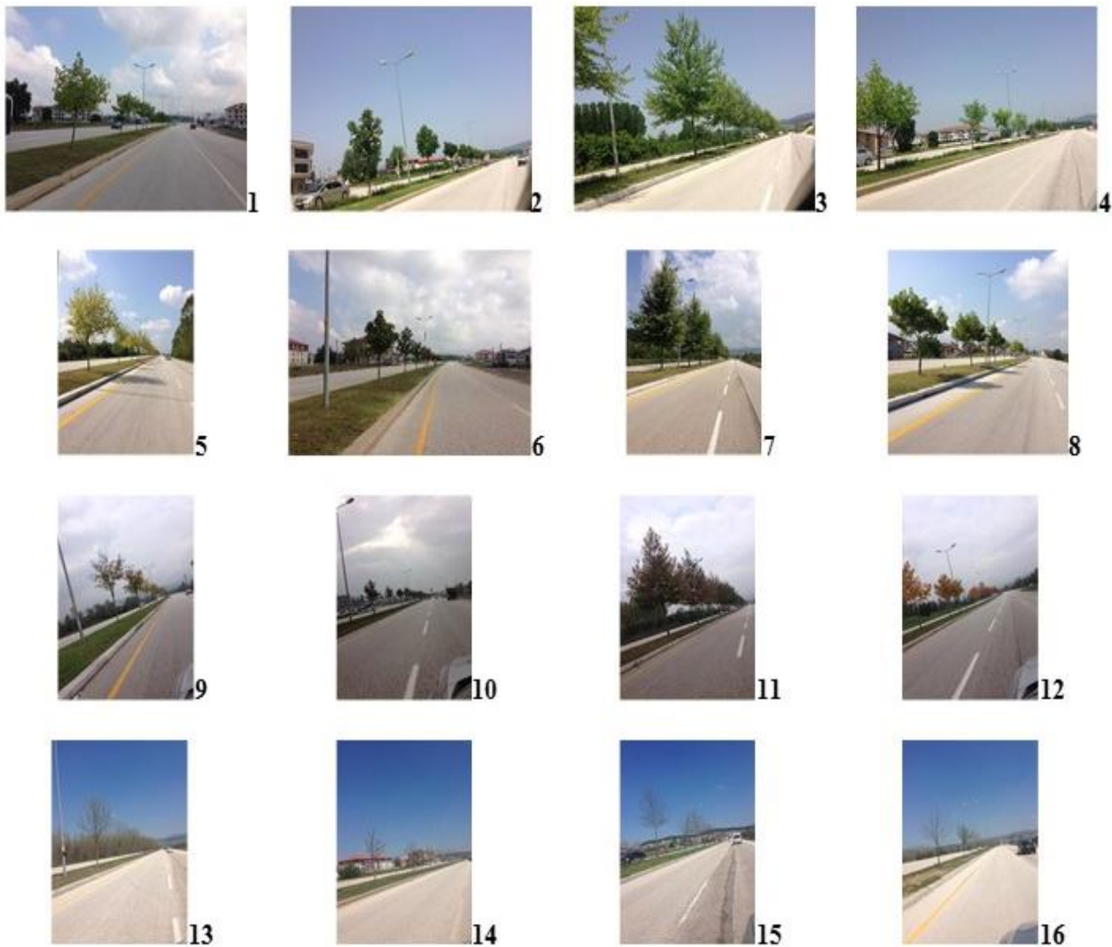
Figure 3. Tree photos used in survey 2.

In each questionnaire, determined adjective pairs were given to the subjects for the evaluation (Acar et al., 2003). These adjective pairs were selected in a way to indicate the differences between the ages and the seasonal changes in the trees. They included “depressing-refreshing”, “ordinary-interesting”, “nondescript-eye-catching”, “inadequate-adequate”, “unpretentious-ostentatious”, “simple-complex”, “boring-soothing”, “disturbing-reassuring” and “unaesthetic-aesthetic”. In the questionnaire, each determined adjective pair was evaluated on a 5-point scale as -2, -1, 0, 1, 2. In order to simplify the process, the data were entered into the computer as values of 1, 2, 3, 4, and 5 (Eroğlu et al., 2012). For instance, if a photo received a score of (-2) for “simple-complex”, it meant that this photo was perceived more as “simple”.