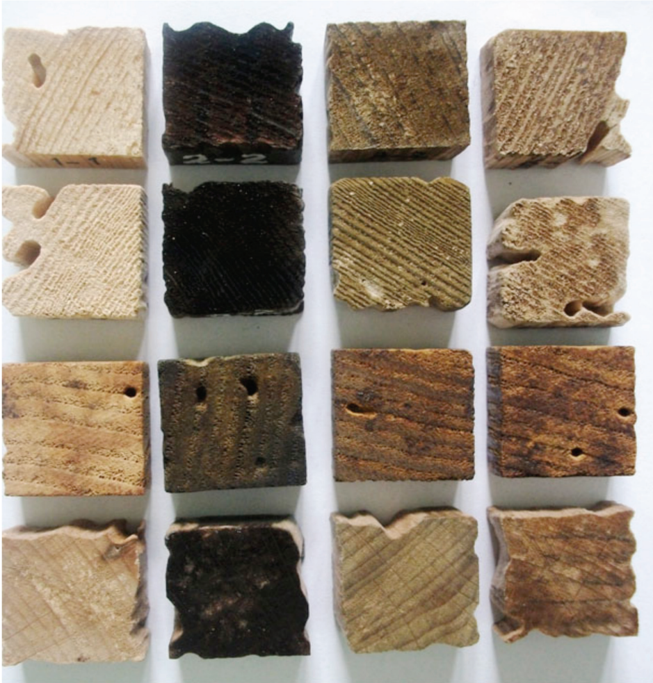
Figure 2. Visual observation of termite damage on some representative control and stained wood samples (Each row represent one species, from top to bottom; Pinus sylvestris (Scots pine), Picea orientalis (Spruce), Castanea sativa (Chestnut), Fagus orientalis (Beech), each column represents one stain treatment, from left to right; Untreated control, aniline, chemical, Van Dyke brown).

Consumption rates of stained spruce sapwood were reduced 83%, 82,2% and 72,1% for the aniline, chemical and Van Dyke brown treatments, respectively. Similarly consumption rate was degraded from 64,4 to 11,4 \mu\text{g}/\text{termite}/\text{day} for Scots pine sapwood when treated with chemical stain at 0,1 \text{kg}/\text{m}^2 retention level. While aniline treatment showed some reduction in the consumption rate for the same species, Van Dyke brown actually increased it. The visual representations are in line with the mass loss and termite mortality data, indicating that while the chemical stain treated softwood species display almost intact structures, the controls and other treatments were moderately or heavily damaged due to termite activity (Figure 2).