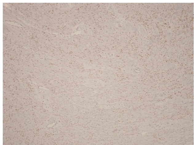
Fig. 1 ER positivity in myofibroblast nucleus (ER × 100)

Descriptive values that measured in the study are shown as mean, standard deviation, median, minimum, and maximum. Shapiro–Wilk test is used for evaluating if estrogen and progesterone levels are in a normal range or not. Mann–Whitney U test is used for comparing leiomyoma numbers and mean percentage of estrogen and progesterone stains. Kendall Tau coefficient is used for evaluating relationship between groups and staining percentages of